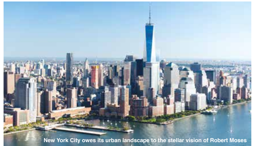
New York City owes its urban landscape to the stellar vision of Robert Moses