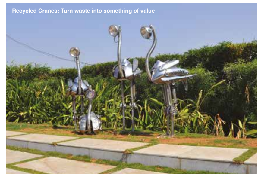
Recycled Cranes: Turn waste into something of value

The writer is a social entrepreneur and the founder of The Urban Vision, a think tank on cities. She is also an architect, critic, writer and a TV journalist.