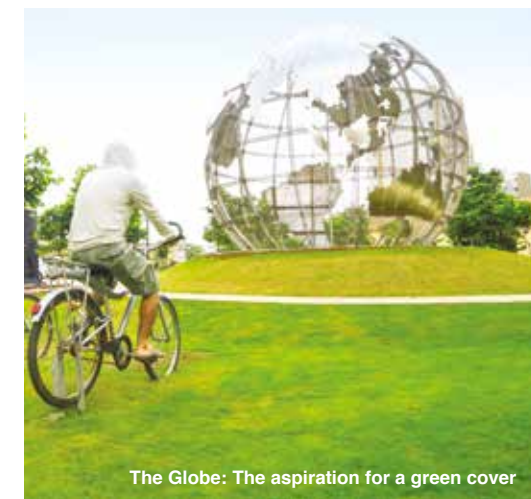
The Globe: The aspiration for a green cover

Public art adds cultural stimulation to daily activities like commuting to work or walking and playing in the community. One of the most invigorating aspects of walking around New York's Fifth Avenue