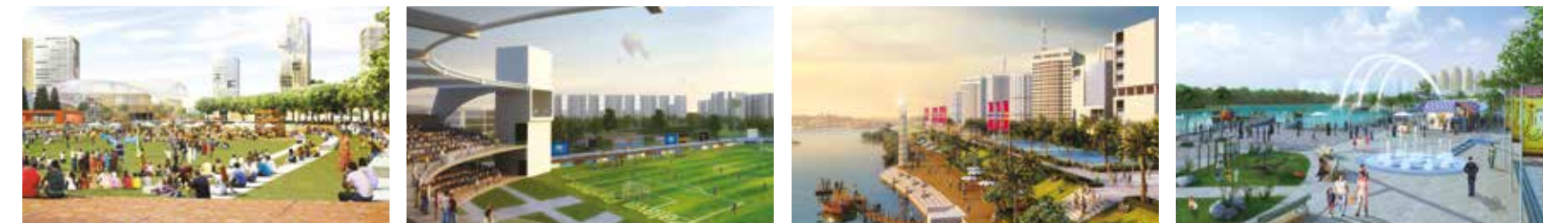
Lush Central Park

PALAVA-THE FINALE [CIRCA 2025] The most liveable city in India and one of the top 50 most liveable cities in the world.