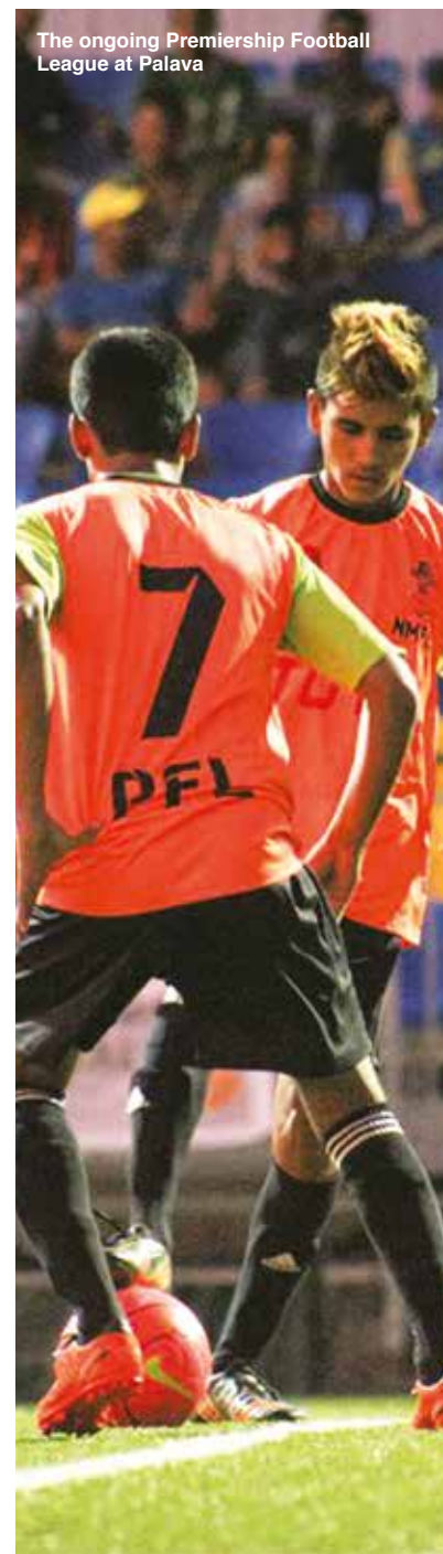
The ongoing Premiership Football League at Palava

The game of life is a lot similar to football, indeed, any sport - we have to block our fears, tackle our problems and score our points when given an opportunity, rising to glory against all odds. Palava is committed towards giving a better quality of life and the vision for a range of sports to be accessible to all; not only through high quality infrastructure, but also high quality, structured training - enabling people to maximize their potential and give talent a platform and place of its own to succeed and go big.