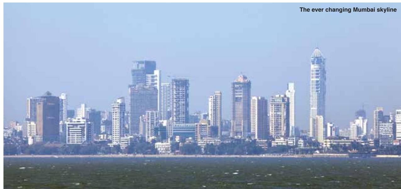
The ever changing Mumbai skyline

The Hub also has an Aquatics Centre, a modular Sports Arena, a Sports