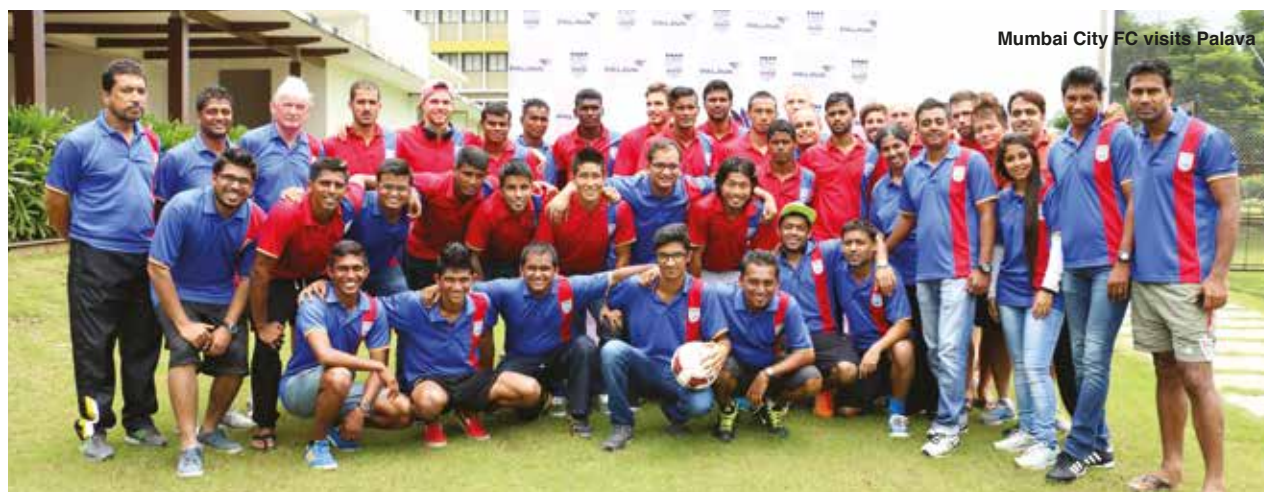
Mumbai City FC visits Palava

Besides regular inter-school tournaments and Arsenal Soccer Schools football camps, Palava also hosted the Mumbai City FC team in the run up to the ISL last year. Not only did the team have their first team session at Palava, they also conducted a special workshop and training session for kids who were thrilled to train and interact with their idols, including Mumbai City FC captain and