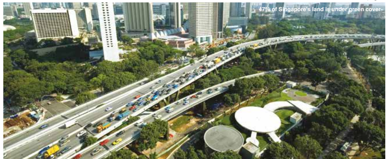
47% of Singapore's land is under green cover