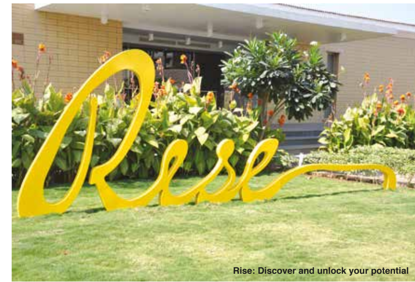
Rese: Discover and unlock your potential