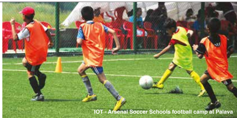
IOT - Arsenal Soccer Schools football camp at Palava