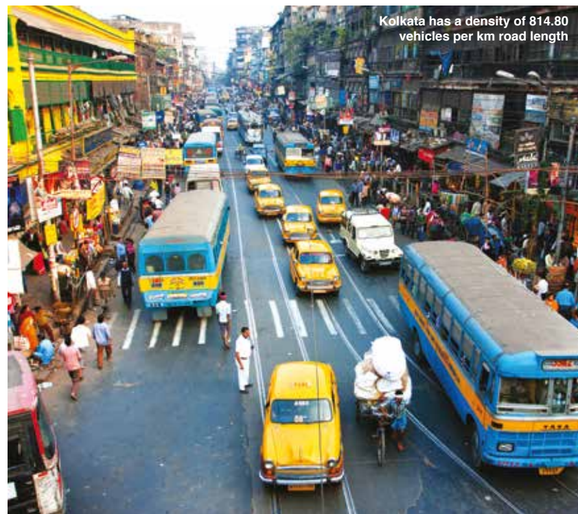
Kolkata has a density of 814.80 vehicles per km road length

osmotic manner, and yet spaces that create alternate cities - those that provide carefully and those that provide all that good cities must.