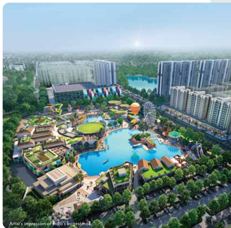
Artist's impression of India's largest mall.

This new-age mall is envisioned to be India's next weekend getaway. With a range of world-class brands available at the shopping arcade, renowned restaurants dotting the boating zone, and numerous adrenaline-pumping rides at the adventure zone, a day here will always be a day well spent. Children can also quench their thirst for knowledge at the Children's Museum, while the entire family can catch the latest releases at a multiplex in the mall. All this is further enhanced by the state-of-the-art facilities the city provides. With the upcoming Lodha World School (CBSE) offering quality education to its students and the Olympic Sports Complex churning out state and national sport champions, the future looks very bright at Palava's newest and most happening neighbourhood.