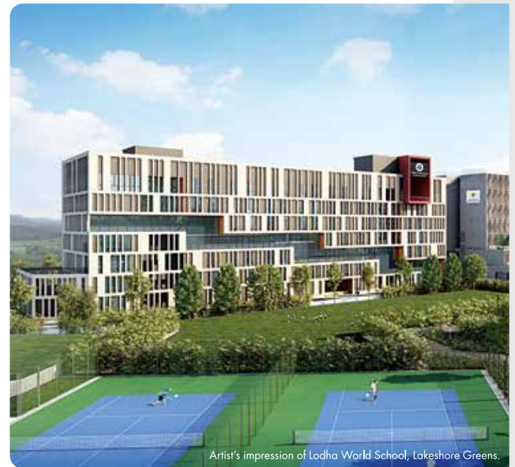
Artist's impression of Lodha World School, Lakeshore Greens.