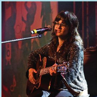
Jasleen Royal mesmerized the audience with her voice.

A burst of colours greeted the excited crowd on both the days of Tarang: The Arts and Cultural Fiesta at Palava – India's No.1 city by The Lodha Group. The newly opened Lakeside Park hosted over 2000 people over the weekend of 13th and 14th January, 2018. The energy in the air was palpable as kids, teenagers and adults alike were entertained to the fullest.